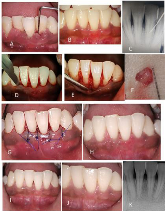
Figure 1. Case 1: Technique of gingival fenestration closure around mandibular left central incisor. (A) Pre-operative photograph showing abundance of plaque and calculus with inflamed and enlarged gingiva. (B) After completion of phase 1 therapy well-defined thin eroded area was evident over mid-buccal aspect of mandibular left central incisor. (C) Radiograph showing insertion of gutta percha point to detect any apical extension. (D) Intra-crevicular incision given and a well-defined gingival fenestration with respect to mid-buccal aspect of mandibular left central incisor. (E) After flap reflection complete dehiscence of bone was present. (F) Connective tissue graft harvested. (G) Placement of interrupted sutures after graft placement. (H) Follow up after 2 weeks. (I) Follow up after 6 months. (J) Follow up after 1 year. (K) Radiograph of treated site after 1 year follow up period.

resolution of inflammation, it was decided to treat the defect with a surgical approach.