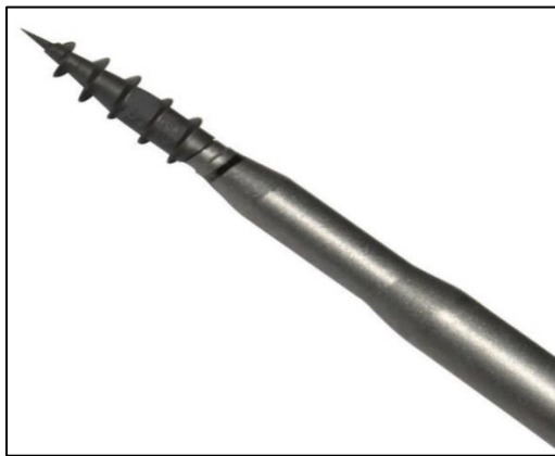
Figure 2: CEPTRE® knotted UHMWPE suture titanium anchor.