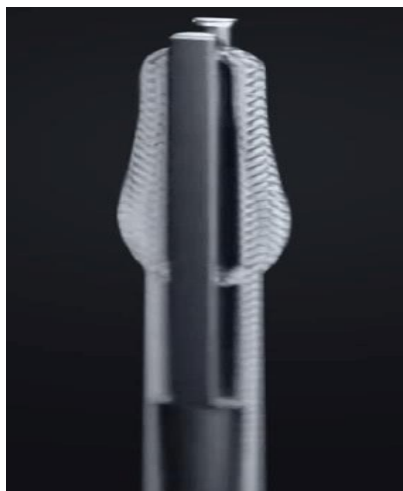
Figure 3: STATIV® knotted UHMWPE suture anchor.