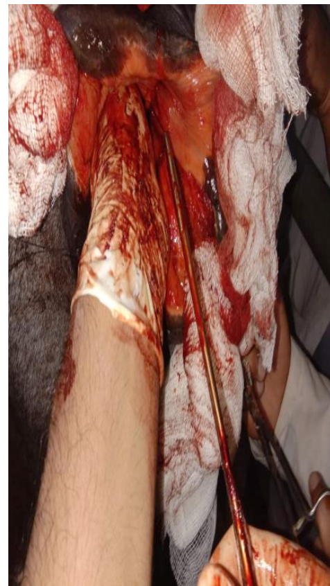
Fig. 3: Intraoperative post-operation