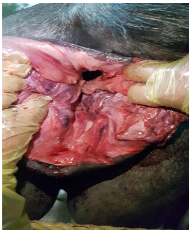
Fig. 1: Rectovaginal laceration in mare

Submitted: 02/04/2019 Accepted: 05/04/2019 Published: 20/4/2019