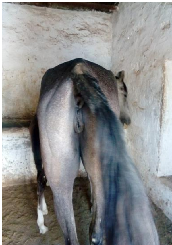
Fig. 5: 2 months